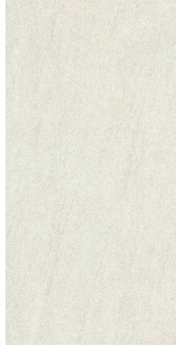
30 x 60 cm (12" x 24") Matte Finish MHV.LS.IVO.1224.MT

All items shown in this document are part of Olympia's stocking program. For special orders, please contact your Olympia Tile Sales Representative.