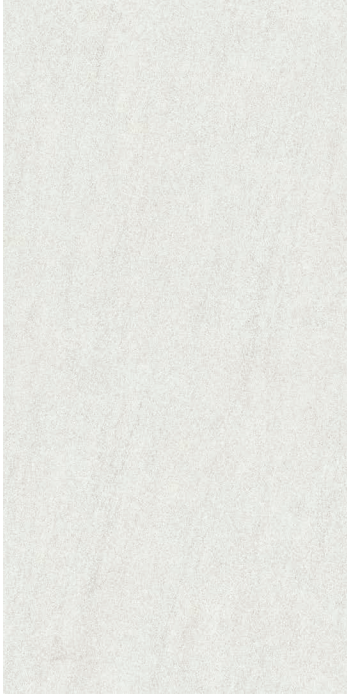
30 x 60 cm (12" x 24") Matte Finish MHV.LS.WHT.1224.MT