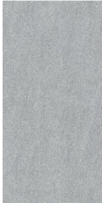
30 x 60 cm (12" x 24") Matte Finish MHV.LS.GRY.1224.MT

All items shown in this document are part of Olympia's stocking program. For special orders, please contact your Olympia Tile Sales Representative.