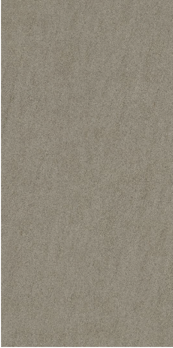
30 x 60 cm (12" x 24") Matte Finish MHV.LS.ERT.1224.MT