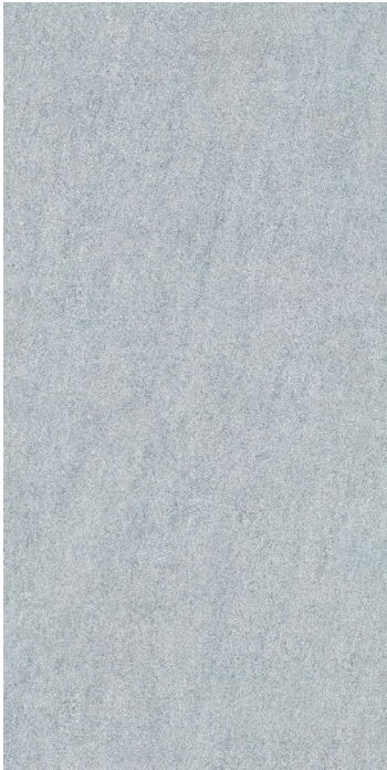
30 x 60 cm (12" x 24") Matte Finish MHV.LS.LGR.1224.MT